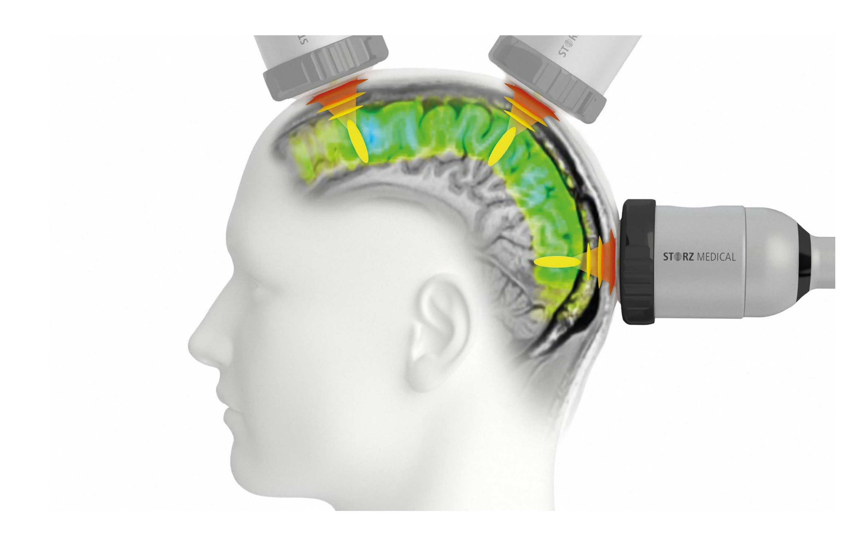
Fig.1 Stimulation-pulses are administered by MRT-tracking on the surface as well as in deeper structures of the brain.

TPS (Transcranial Pulse Stimulation), which can be individually tracked by MRT-scans, offers new perspectives to ameliorate deficits caused by AD. Pilot studies show beneficial effects on learning and memory of TPS. There are also reports of restorative structural changes in the thickness of the cerebral cortex due to the stimulation.